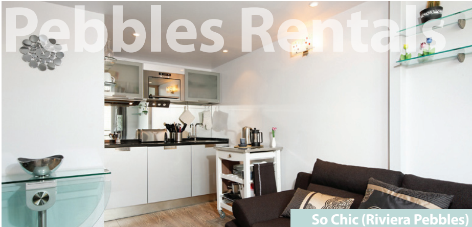
So Chic (Riviera Pebbles)