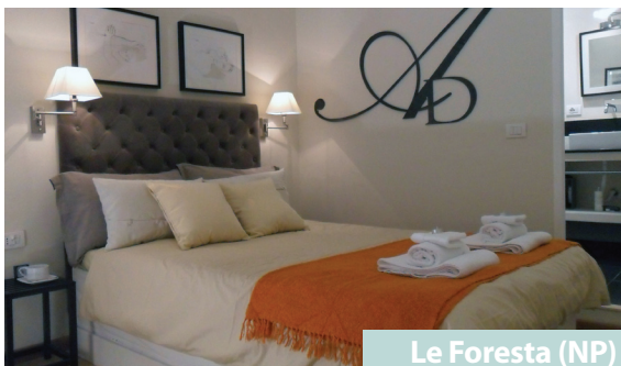
Le Foresta (NP)

Take advantage of Pebbles packages. Let us take care of you with airport transfers, mid-stay cleans and groceries.