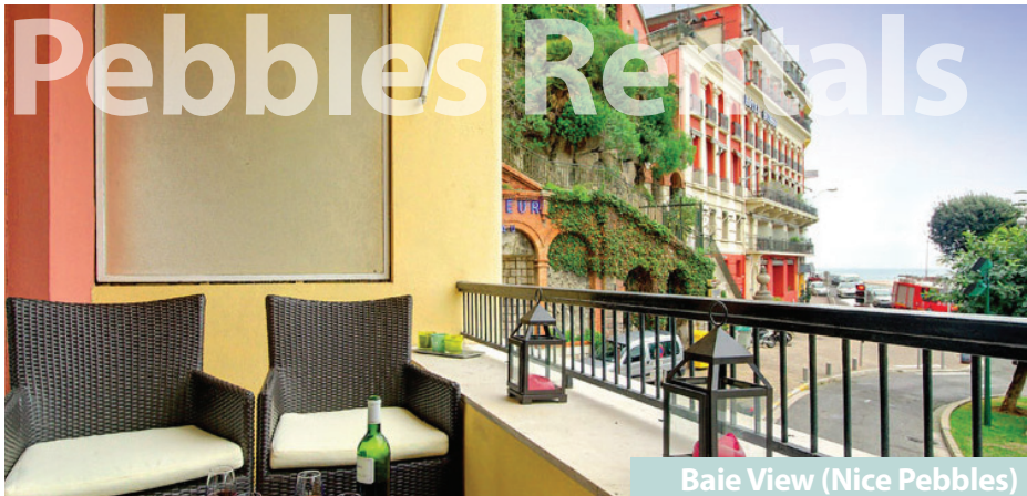
Baie View (Nice Pebbles)