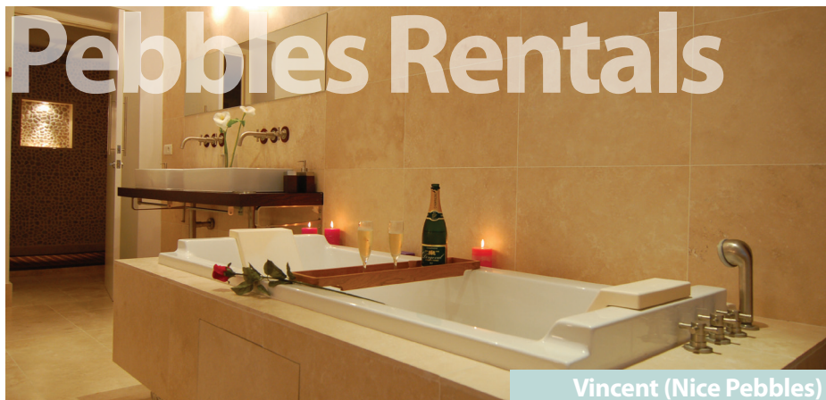
Vincent (Nice Pebbles)