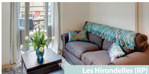
Les Hirondelles (RP)