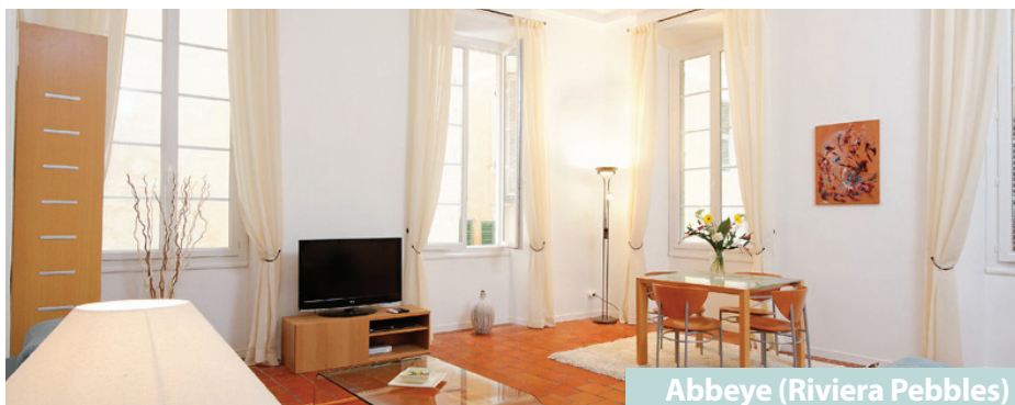
Abbeye (Riviera Pebbles)