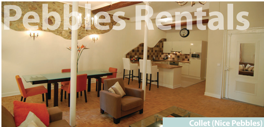
Collet (Nice Pebbles)