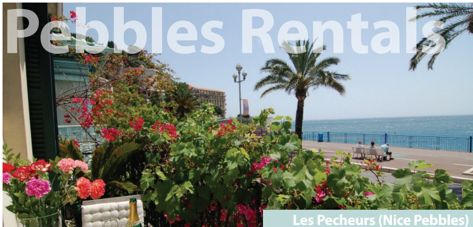
Les Pecheurs (Nice Pebbles)