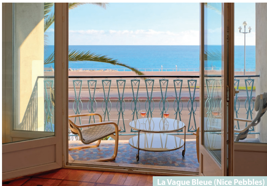
La Vague Bleue (Nice Pebbles)

Holidays made perfect by Mediterranean views, day and night.