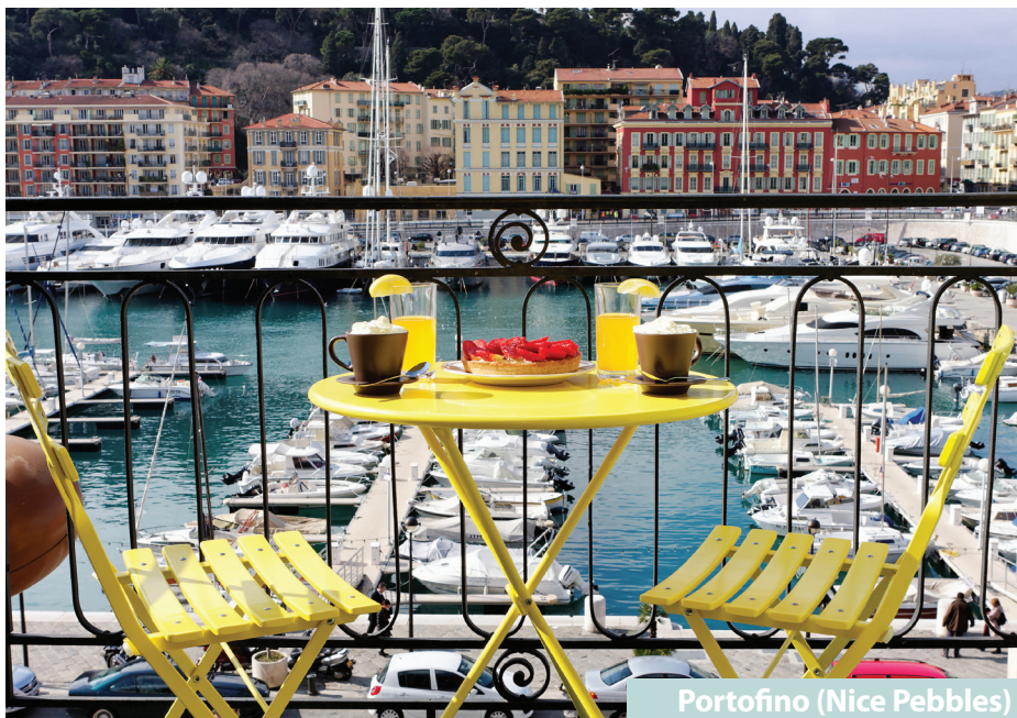
Portofino (Nice Pebbles)