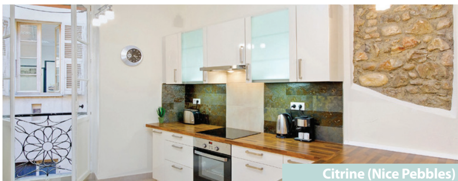
Citrine (Nice Pebbles)